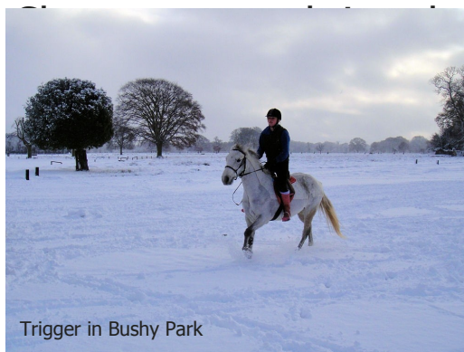
Trigger in Bushy Park