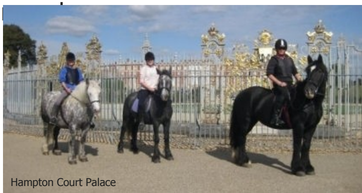
Hampton Court Palace