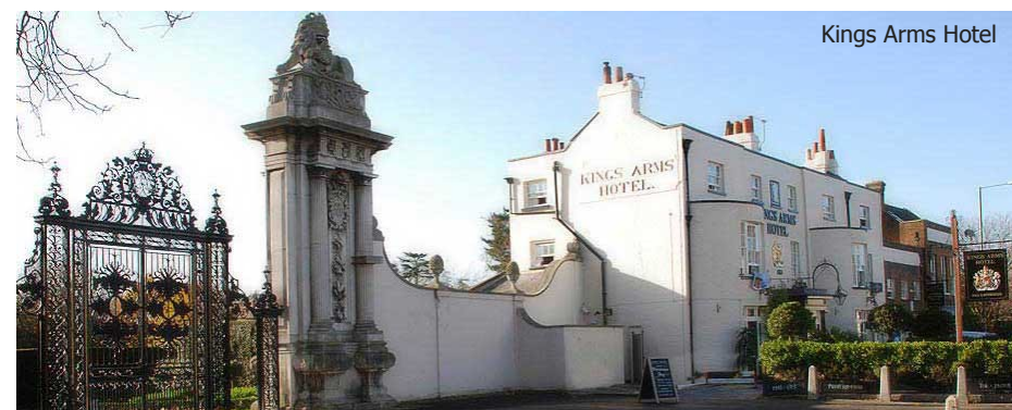
Kings Arms Hotel